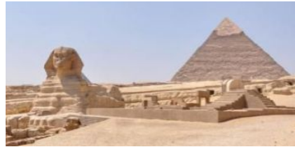
pyramids / sphinx